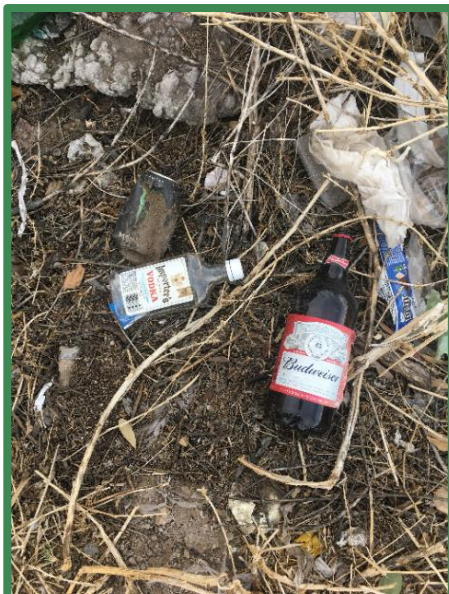
Behind alcohol outlet on El Paseo Rd, Las Cruces

(Las Cruces Community Outreach Interviews, 2019)